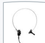
Bone Conductor B81