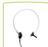
Bone Conductor B71