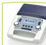
MA 28 device