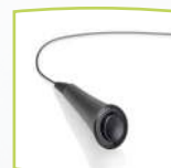
Patient response switch