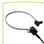
BC headset B71