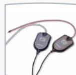
Insert phones IP30