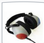
AC headset Holmco 8103