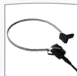
BC headset B81