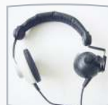
BC headset BKH 10-3