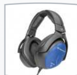
AC headset HDA300 for high frequency