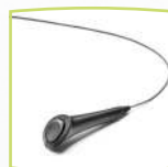
Patient response switch