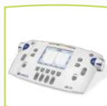
MA 42 device